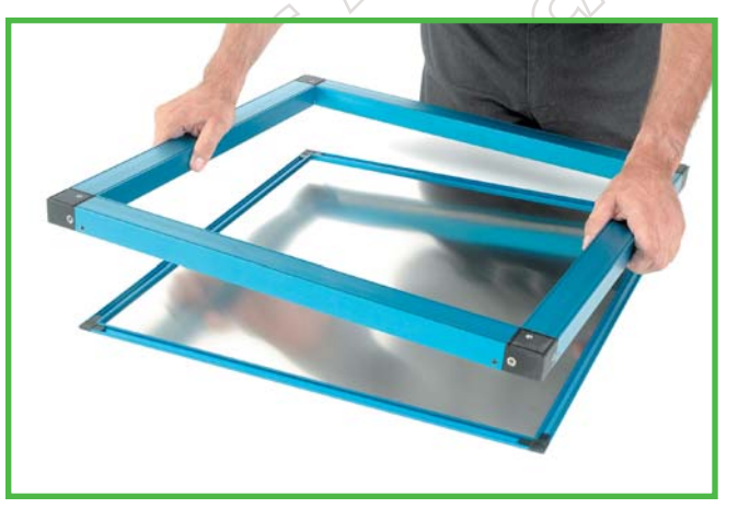
FIGURE 1: For set-up, the stencil is placed in a loading base and tensioned on the frame.

The interchangeable foil features a row of mounting apertures stamped or cut along each edge of the stencil foil during manufacture. The frame has a row of retractable pins corresponding to each row of stencil apertures, which are engaged as the stencil is mounted in the frame